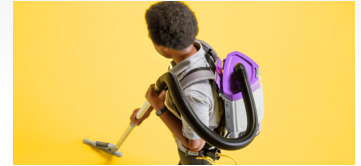
Ease of Use