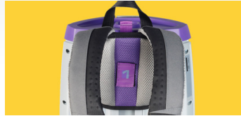
Comfort + Ergonomics