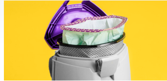
Cleaning for Health