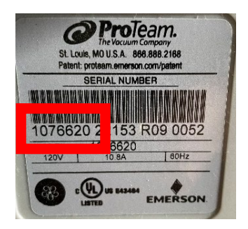
Figure 1 – Serial Tag Serial Tag Model Number Identification

This is an important Product Safety Notice to all owners, distributors and service providers of the ProTeam GoFit 3 (model 1076620), GoFit 6 (model 1076630), GoFit 6 PLUS (model 1076650), and GoFit 10 (model 1076640) commercial backpack vacuum cleaners.