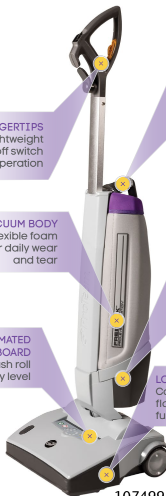
107499 FreeFlex Cordless/Corded

LOW PROFILE Compact design lays flat to clean under furniture and obstacles