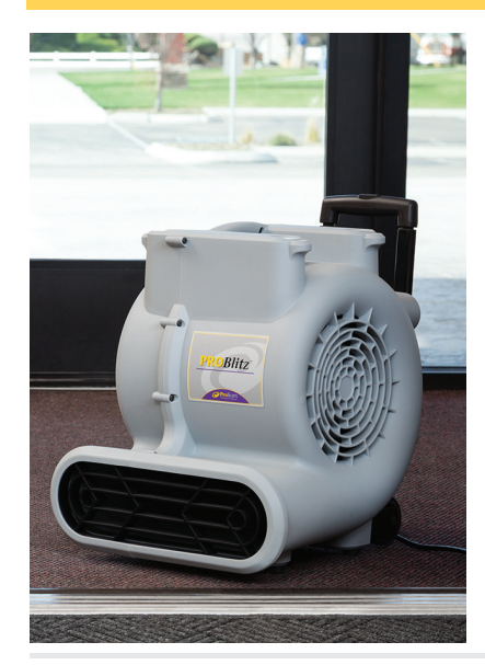
*Source — DKI Restoration, How to Dry Wet Carpet https://www.dkiservices.com/blog/2020/03/29/ how-to-dry-wet-carpet/

If carpet is wet due to flooding or a burst pipe, it should be dried as quickly as possible. Neglecting the problem for more than 24 to 48 hours could allow mold to start growing.* Mold growth is accelerated in warm conditions with considerable moisture.** Fabrics that dry slowly can develop odors. The use of air movers can facilitate the drying process.