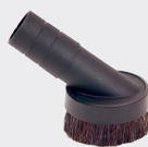
#100110 Dust Brush

THE RIGHT TOOL FOR THE RIGHT JOB A VAST ARRAY TO MEET YOUR NEEDS