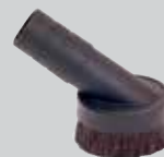
#100110 Dust Brush